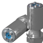
SLA RS kit